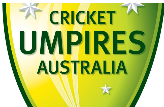
Cropped image of the CA Ump